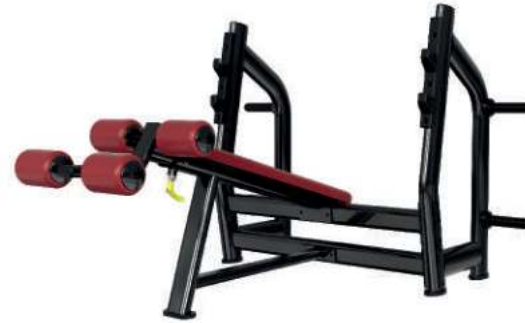
OLYMPIC DECLINE BENCH