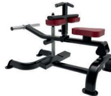
SEATED CALF RAISE