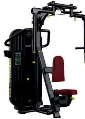
PEC DECK FLY