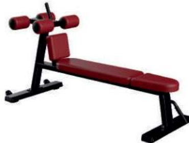
SIMPLE WEB BOARD