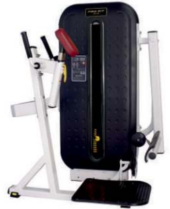
STANDING LEG EXT