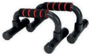
Push Up Bar