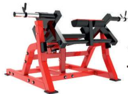
SEATED LEG EXT.