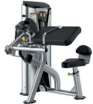
BICEPS + TRICEPS