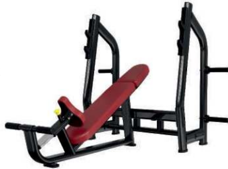
OLYMPIC INCLINE BENCH