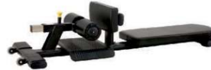
SISSY SQUAT + BENCH