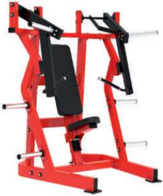
LATERAL DECLINE CHEST PRESS