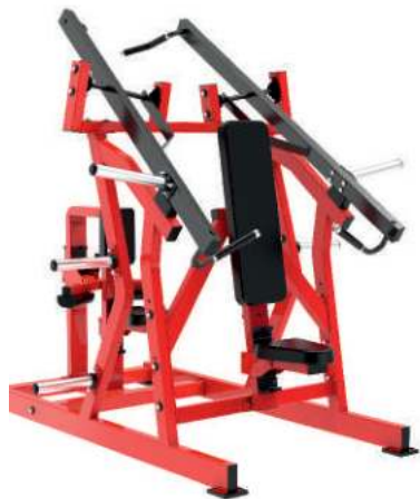
CHEST PRESS + PULL DOWN