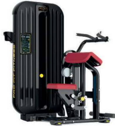
BICEPS + TRICEPS PRESS