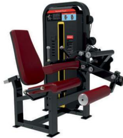
LEG EXT.+ LEG CURL