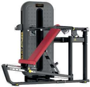
CHEST PRESS/ SHOULDER PRESS