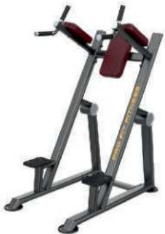
VERTICAL KNEE RAISE