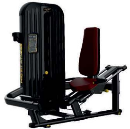
SEATED CALF MACHINE