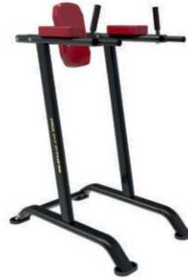
VERTICAL KNEE RAISE