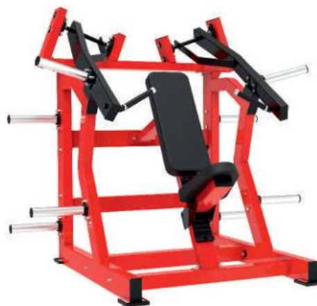
SUPER INCLINE PRESS