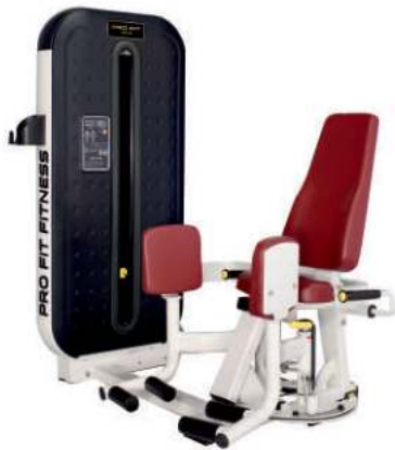
OUTER THIGH ABD