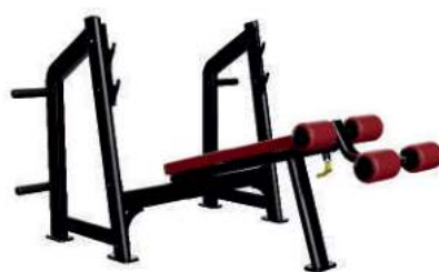
DECLINE OLYMPIC BENCH