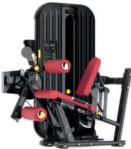
LEG CURL + EXT.