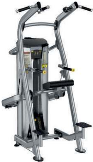
CHIN UP ASSIST