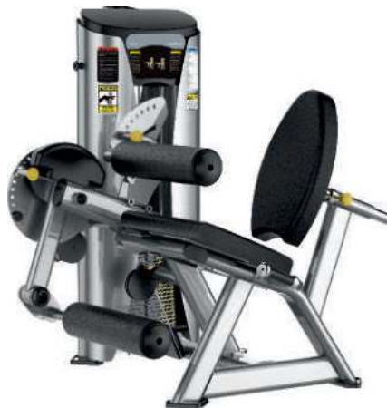
LEG CURL + EXTENSION