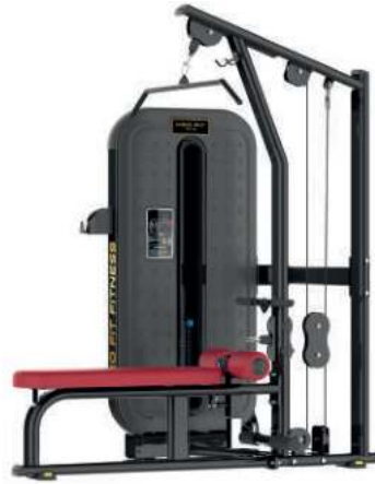
LAT PULL DOWN/ ROW