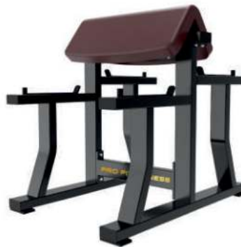
STANDING PREACHER CURL BENCH