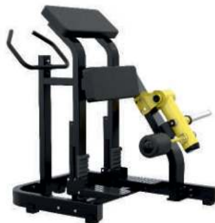
STANDING LEG CURL