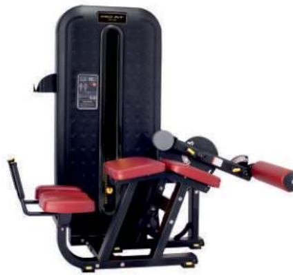
PRONE LEG CURL