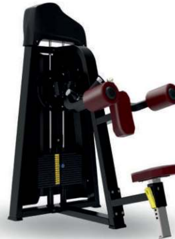
DELTOIDS FLY MACHINE