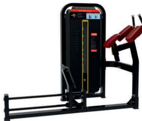
STANDING CALF RAISE