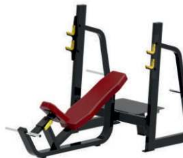
OLYMPIC INCLINE BENCH