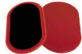
Premium Core Slider