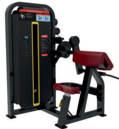
Biceps & Triceps Curl