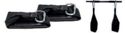
Power AB Sling