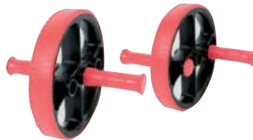
AB Slide Wheel