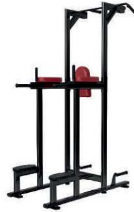
VERTICAL KNEE RAISE