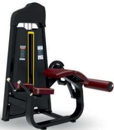
PRONE LEG CURL MACHINE