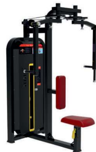
PEC DECK FLY