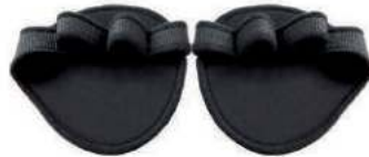
Weight Lifting Gloves