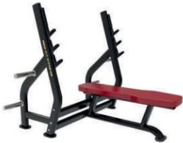
FLAT OLYMPIC BENCH