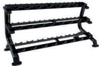
DUMBBELL RACK 3 TIER