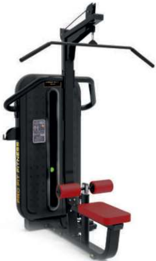
LAT PULL DOWN