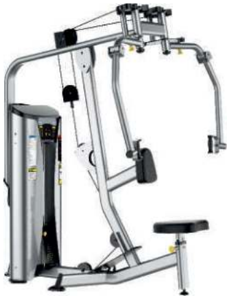
PEC DECK FLY