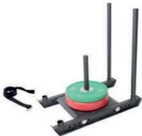
Power Dog Sled