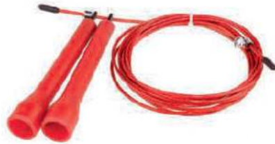
Cable Jump Rope