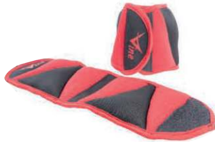
Soft Ankle/Wrist Weight