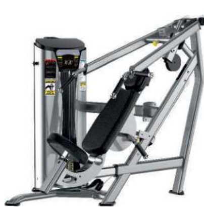
CHEST + SHOULDER PRESS