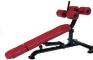
ADJUSTABLE WEB BOARD