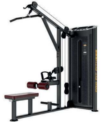
LAT PULL DOWN + ROW