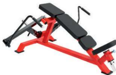
INCLINE PEC FLY