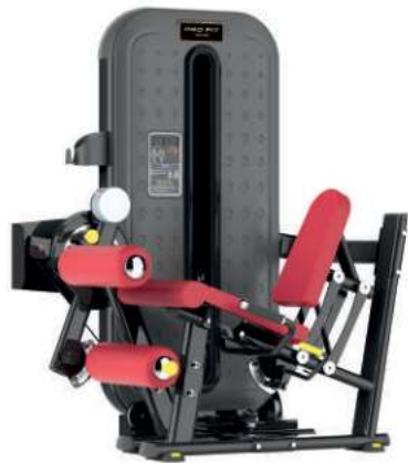
LEG EXTENSION/ LEG CURL