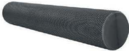
Deluxe Foam Roller