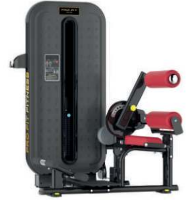
LOWER BACK / ABDOMINAL