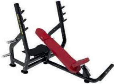
INCLINE OLYMPIC BENCH