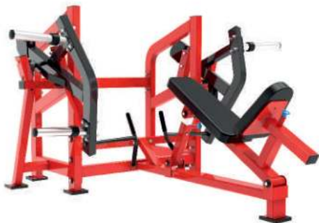
INCLINE CHEST PRESS