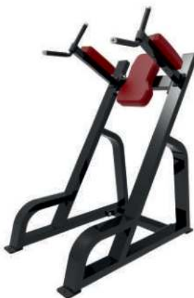
VERTICAL KNEE RAISE