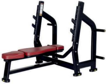
OLYMPIC FLAT BENCH