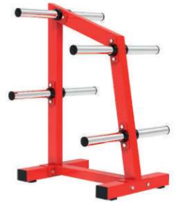
WEIGHT PLATE RACK