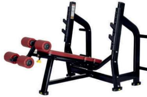
OLYMPIC DECLINE BENCH