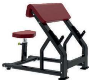
PREACHER CURL BENCH