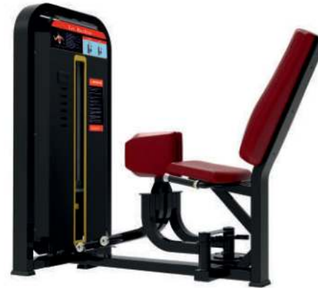
INNER THIGH ADDUCTOR