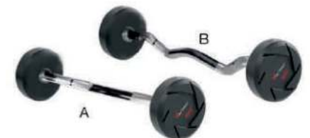
CPU/Rubber Coated Barbell