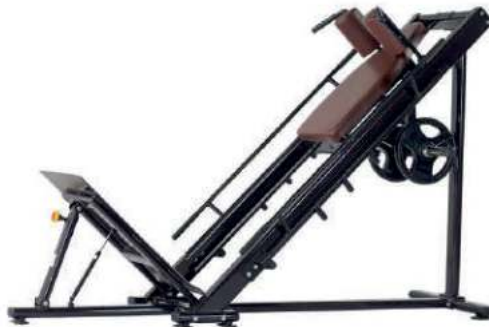
HACK SQUAT MACHINE