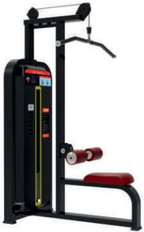
LAT PULL DOWN