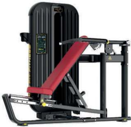
CHEST + SHOULDER PRESS