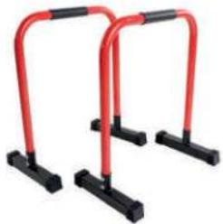
Pro Body Equalizer