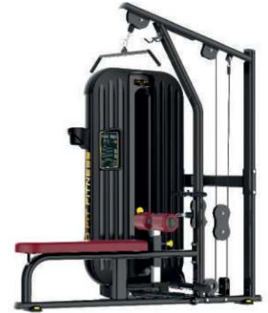
LAT PULL DOWN + ROW