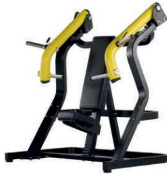
INCLINE CHEST PRESS