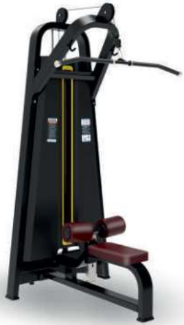
LAT PULL DOWN