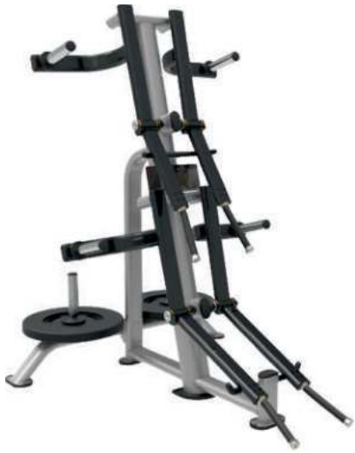
POWER LATERAL MACHINE