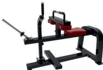
SEATED CALF MACHINE