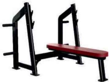
FLAT OLYMPIC BENCH