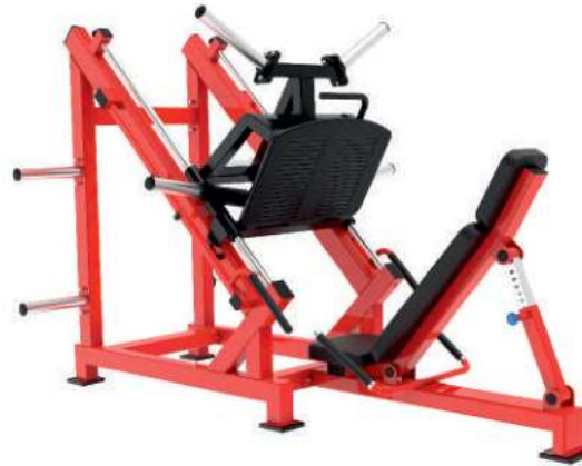
LINEAR LEG PRESS