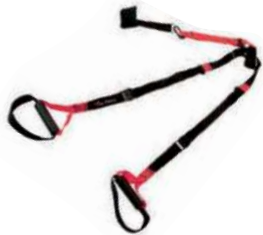
Suspension Training Strap