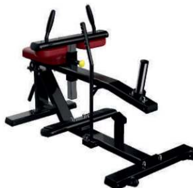
SEATED CALF RAISE