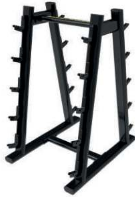
FIXED WEIGHT BAR STAND