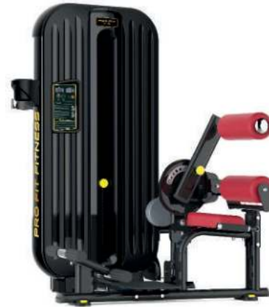
LOWER BACK + ABDOMINAL