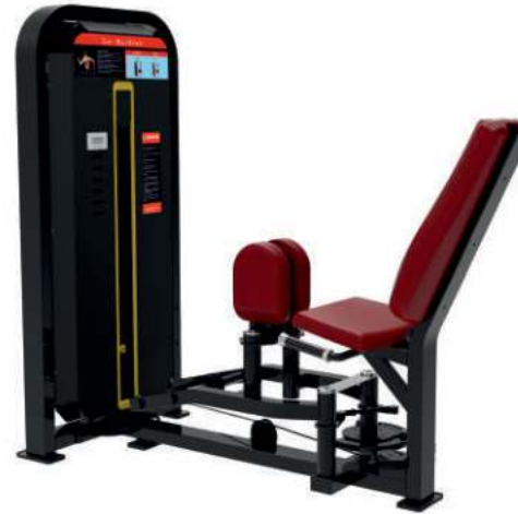
Inner Outer Adductor