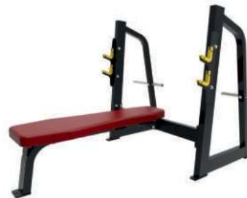
OLYMPIC FLAT BENCH