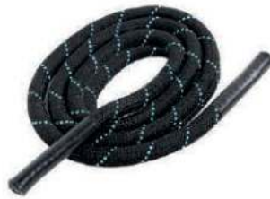
Battle Rope 15 mtr