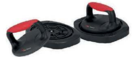
Deluxe Dual Slid Wheel