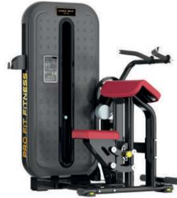
BICEPS CURL/ TRICEPS CURL