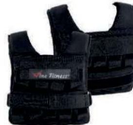
Adjustable Weighted Vest