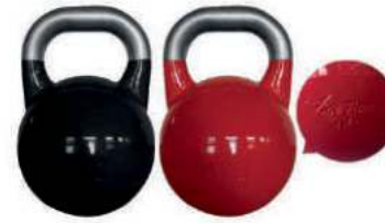
Pro Competition Kettlebell