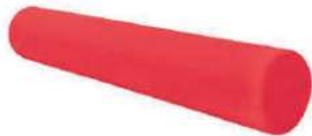
Deluxe Foam Roller