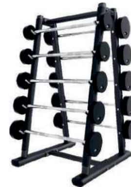
BARBELLS WITH RACK