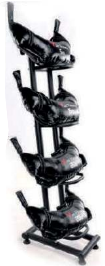
Vine Pro Bag Weight