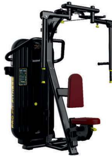
PEC DEC FLY + SHOULDER