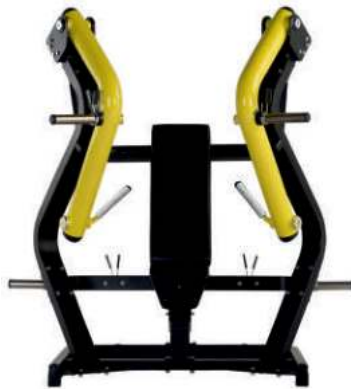
WIDE CHEST PRESS