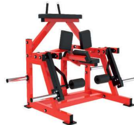
KNEELING LEG CURL