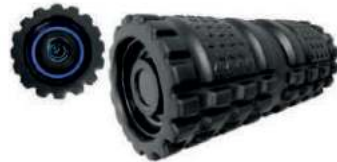
Vibration Foam Roller