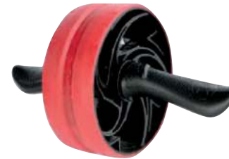
Pro AB Roller