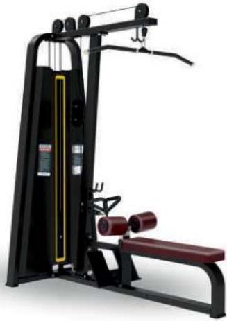
LAT PULL DOWN/ ROW