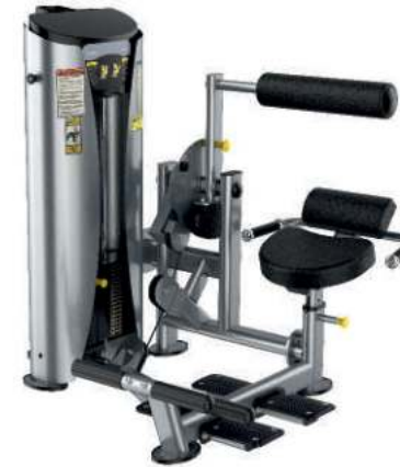
BACK + ABS