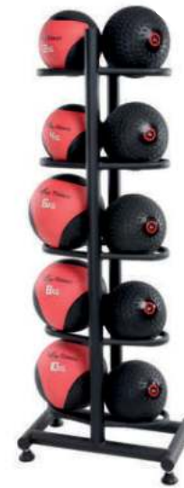
10 Ball Rack