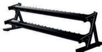
DUMBBELL RACK 2 TIER