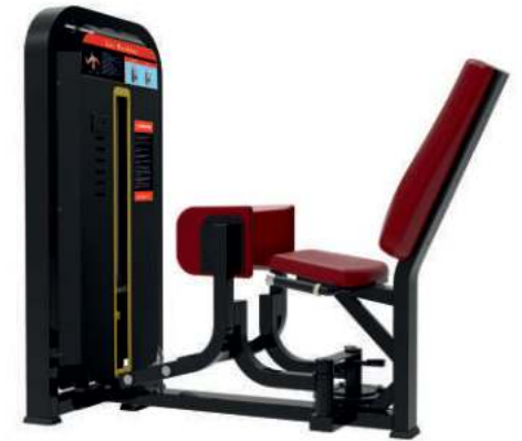
OUTER THIGH ADDUCTOR