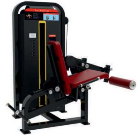
Leg Ext./Prone Leg Curl