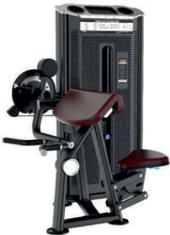
BICEPS + TRICEPS