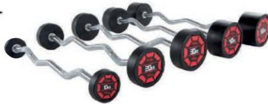
CPU Barbell With Curl Handle