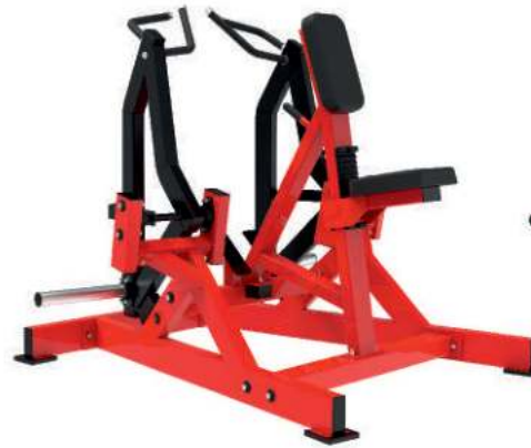
PLATE-LOADED ISO-LATERAL ROW