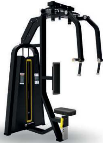
PEC DEC FLY