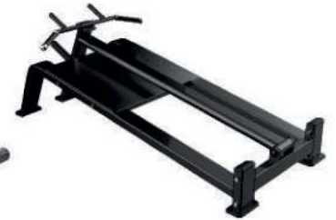
T ARM MACHINE