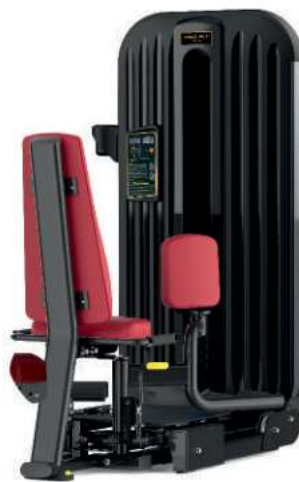
INNER + OUTER ABDUCTOR