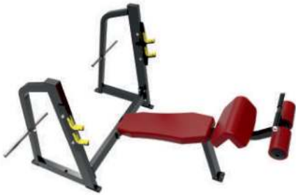
OLYMPIC DECLINE BENCH