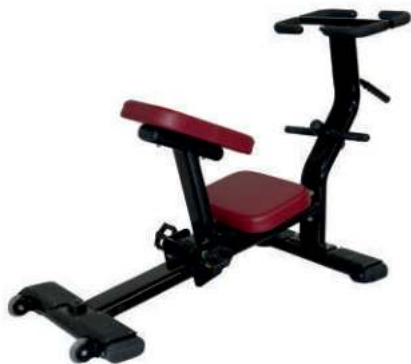
DRAW MUSCLE MACHINE