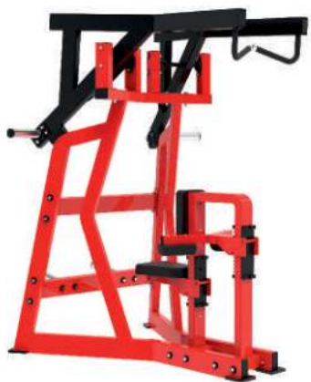
ISO-LATERAL FRONT LAT PULLDOWN