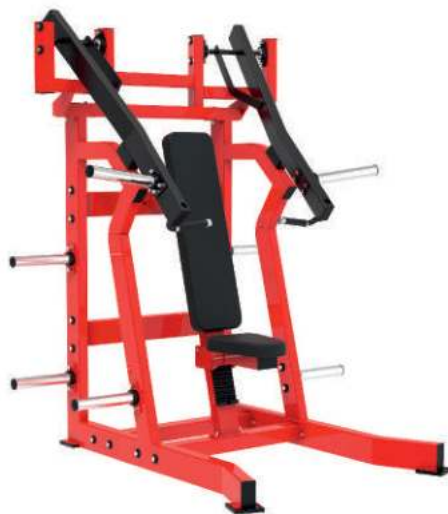
ISO-LATERAL BENCH PRESS