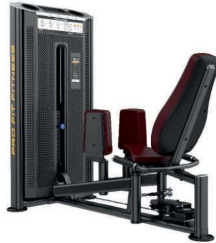
INNER OUTER THIGH ADDUCTOR