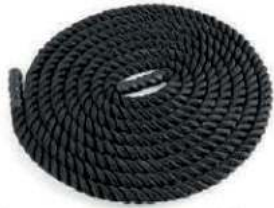
Battle Rope 9 mtr