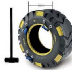
Pro Training Tyre