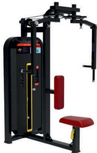
PEC DECK FLY+BACK