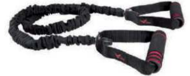
Tube with Safe Sleeve