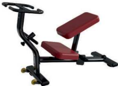
DRAW MUSCLE MACHINE