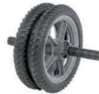
AB Wheel Pro