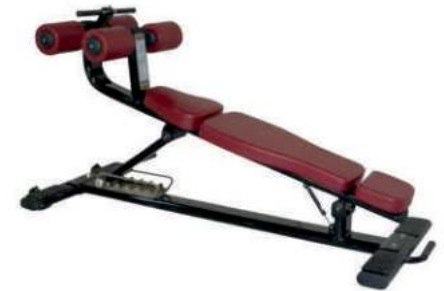
ADJUSTABLE WEB BENCH