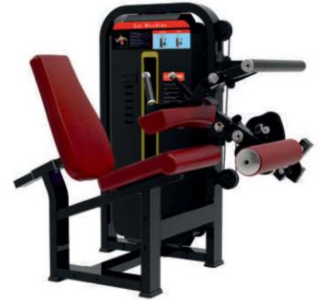
SEATED LEG CURL