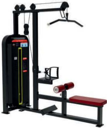
LAT PULL DOWN/ ROW