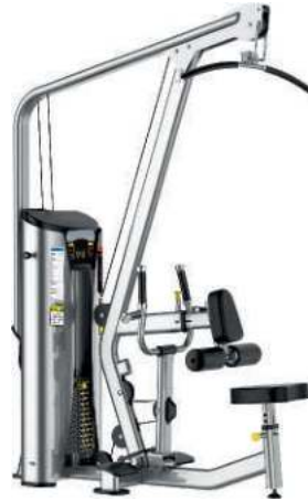
LAT PULL DOWN+ROW