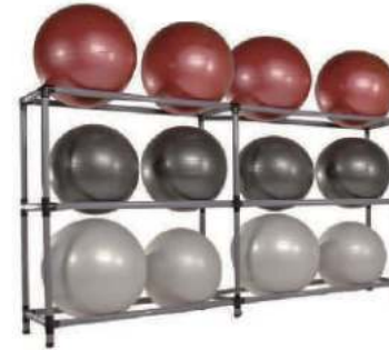
Gym Ball Storage