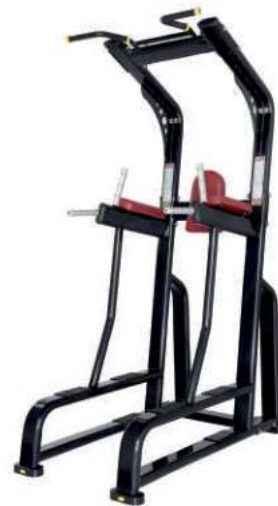
VERTICAL KNEE RAISE