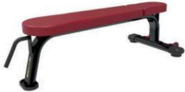
FLAT SIMPLE BENCH