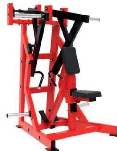
LATERAL LOW ROW