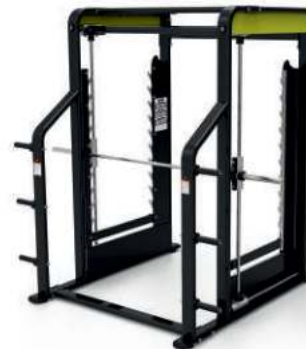
3D SMITH MACHINE