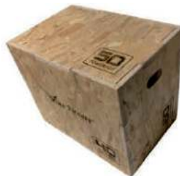
3 IN 1 Jump Box