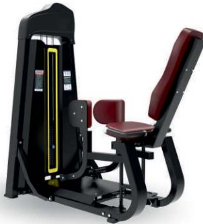
INNER THIGH ADDUCTOR