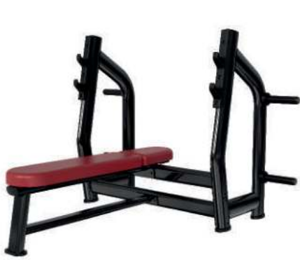
OLYMPIC FLAT BENCH