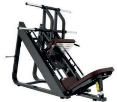
LEG PRESS + HACK SQUAT