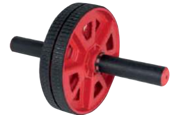
Deluxe Dual Slid Wheel