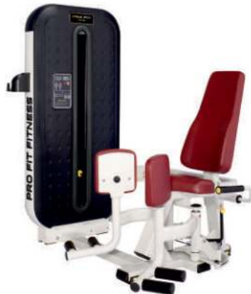
INNER THIGH ABD