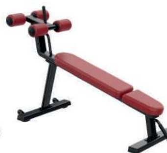
SEATED CALF RAISE