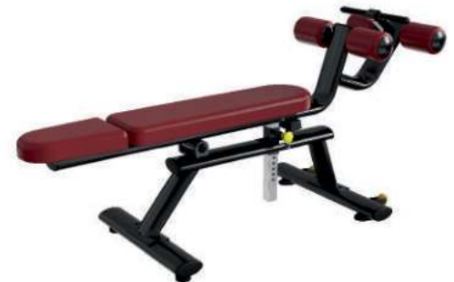
ADJUSTABLE WEB BENCH