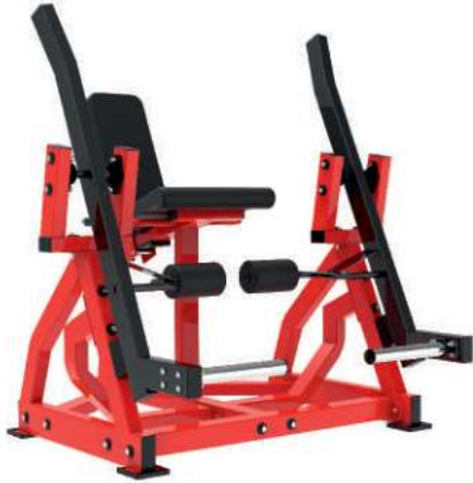
LATERAL DECLINE CHEST PRESS