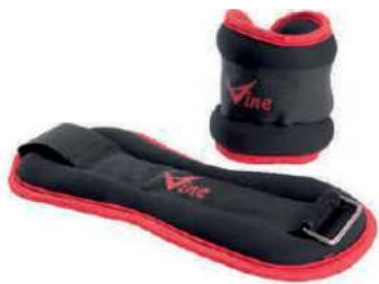
Soft Ankle/Wrist Weight