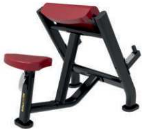
PREACHER CURL BENCH