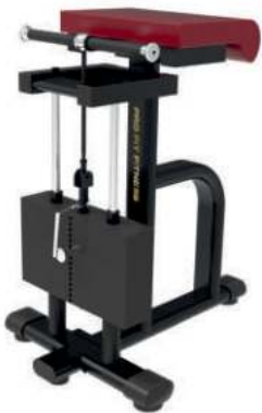
WRIST CURL MACHINE