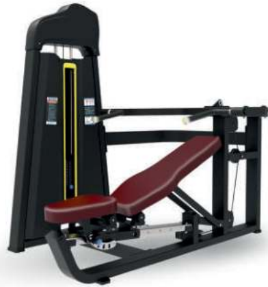
MULTI PRESS MACHINE