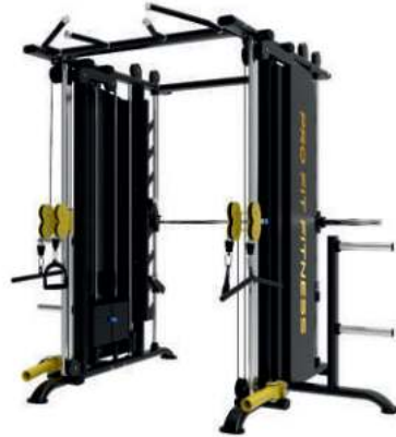
FUNCTIONAL TRAINER + SMITH MACHINE