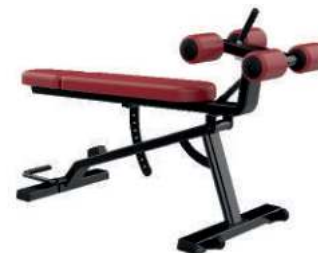
ADJUSTABLE WEB BOARD