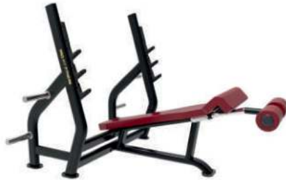
DECLINE OLYMPIC BENCH