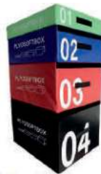
Soft Poly Boxes