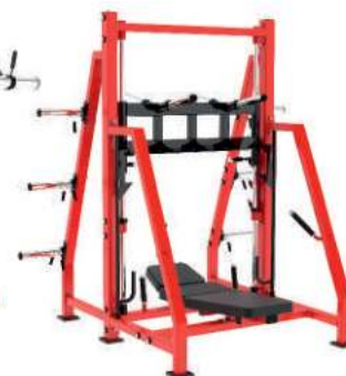
VERTICAL LEG PRESS