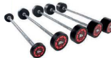
CPU Barbell With Straight Handle