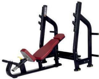
OLYMPIC INCLINE BENCH