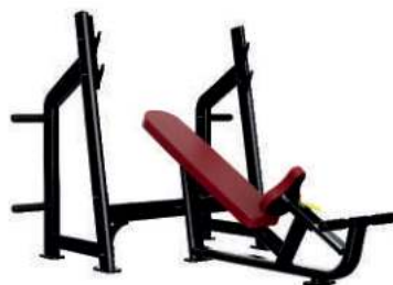
INCLINE OLYMPIC BENCH