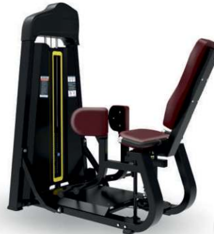
OUTER THIGH ADDUCTOR