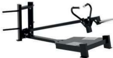
T ARM MACHINE