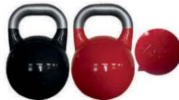
Pro Competition Kettlebell