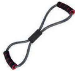
8 Toning Tube