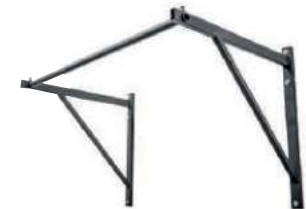
CHIN UP STAND