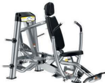
DECLINE CHEST PRESS