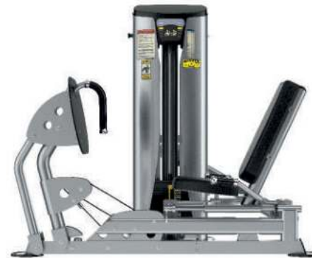
LEG PRESS + CALF RAISE