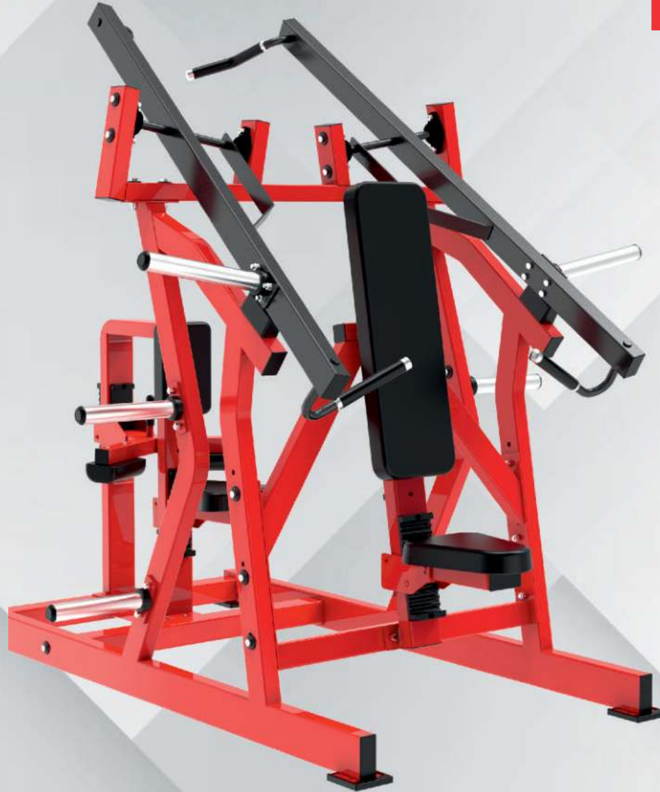
PLATE LOADED STATIONS