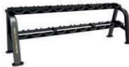
DUMBBELL RACK 2 TIER