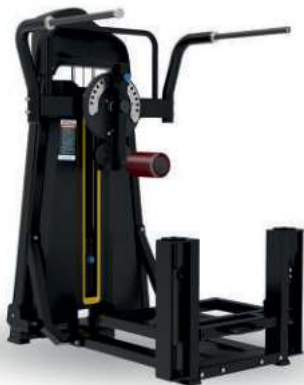
MULTI HIP MACHINE