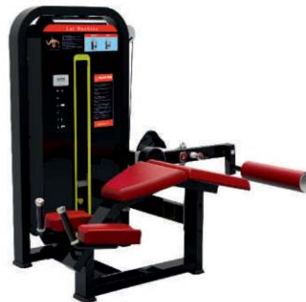
PRONE LEG CURL