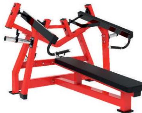
ISO FLAT PRESS