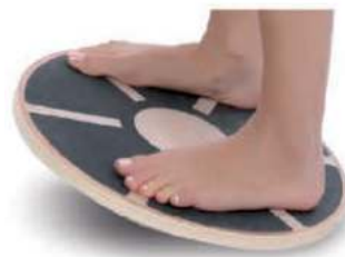
Wooden Balance Board