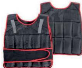
Adjustable Weighted Vest