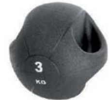
Dual-Grip Pro Medicine Ball