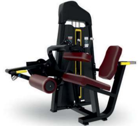
LEG EXTENSION & CURL MACHINE