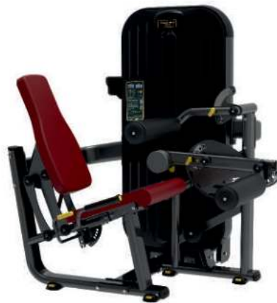
SEATED LEG CURL