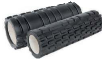
Foam Roller Set