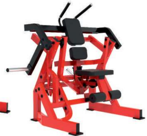
ABDOMINAL OBLIQUE CRUNCH