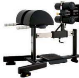
GLUTE HAM DEVELOPER