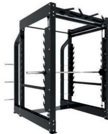
3D SMITH MACHINE