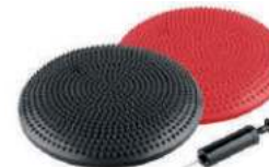
Air Stability Wobble Cushion