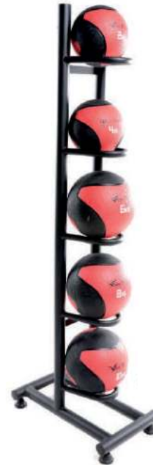
5 Medicine Ball Rack