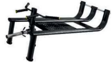
T ARM MACHINE