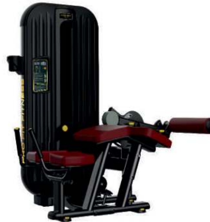
PRONE LEG CURL